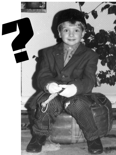
Who is this little fellow?

I have received a letter from a Catholic lady in Clacton who is anxious that someone should keep an eye on her sister's