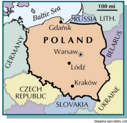
Mapping Specialists, Ltd.

Day 2 - Guided visit to the Bishop's Palace in which the Holy Father Pope John Paul II gave sermons and heard confessions. There will also be a visit to Wawel Cathedral and a visit to the New Basilica .