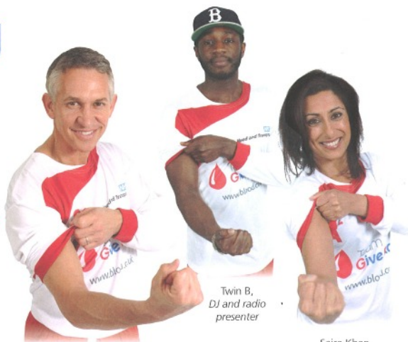
Gary Lineker, Former footballer and television presenter