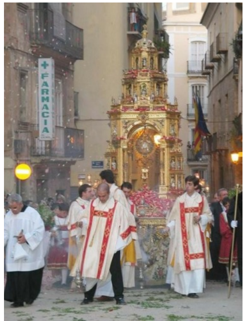
Corpus Christi in Valencia