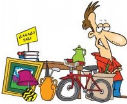
Table Sale at The New Mazenod Hall, St Peter's RC Church, Eastwood

Road North, Leigh-on-Sea, SS9 4BX Saturday 24th