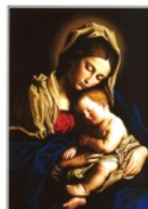
Christmas 2011 ST TERESA'S R.C. CHURCH, ROCHFORD & ST PIUS X R.C. CHURCH, HOCKLEY