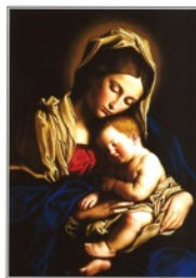
Christmas 2011 ST TERESA'S R.C. CHURCH, ROCHFORD & ST PIUS X R.C. CHURCH, HOCKLEY

We are very pleased to have 4000 Christmas Cards printed for the Parish, and we will shortly be delivering them. We ask that everyone take part in this by volunteering to deliver 25 -50 cards to a street near