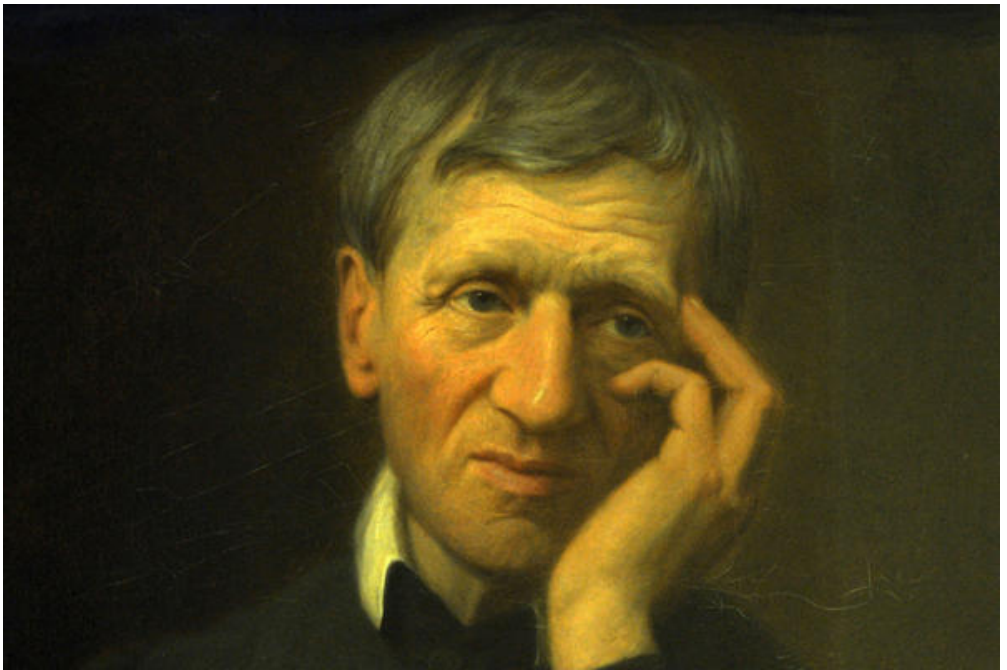
Blessed Cardinal John Henry Newman, Patron of the Ordinariate of Our Lady of Walsingham Whose Feast day falls today (9th October)